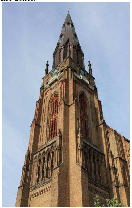
Fig. 9. Church after completion of II stage

In 2005 it was decided to prepare documentation for the completion of stage IIb of works execution in the church tower<sup>21</sup>. The scope of tasks included changing of functional solutions in the interior of the lower, rectangular part of its body, designing clock floor for observation deck and repair of facades. In connection with granting usage to rooms inside the tower, one solved the issue of fire, inter alia, by the introduction of smoke installation on emergency exit and the use of fire zones.