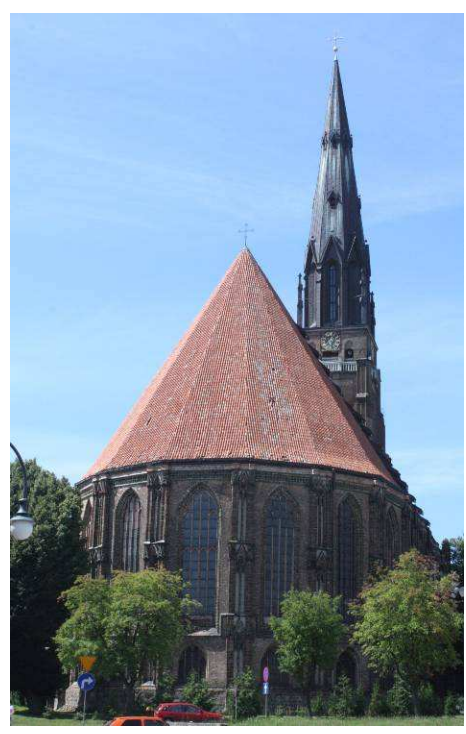
Fig. 10. Church after completion of II second stage